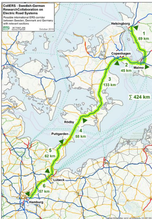
Figure 1: Chosen corridor route for the feasibility study

First, we considered various potential corridor routes based on results from a traffic flow projection for year 2050 (see [3]). We chose a route from Hamburg via Lübeck, crossing the Fehmarnbelt between Puttgarden and Rødby and over the Öresund (Figure 1) with a total length of 424 km. Already today, this route is very important (using a ferry link over the Fehmarn Belt). It will become even more important in the future after realisation of the Fixed Fehmarn Belt Link. Then it will offer a purely land-bound and direct motorway and railway connection between the metropolitan areas of Hamburg, Copenhagen, Malmö, Göteborg and Stockholm and thus it will be a meaningful corridor for a possible ERS-connection between Scandinavia and Germany.