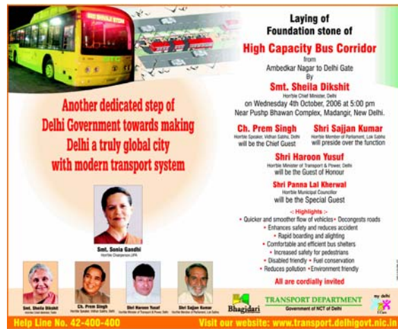
Figure 1. Newspaper advertisement announcing launch of first BRT corridor in

Implementation of the BRT has commenced in Delhi, however, at times it seems that accommodating the primary demands of the major stakeholders of the 'Transport Industry' – the Delhi Metro Rail Corporation (DMRC), the public works department, light rail and monorail industry in the planning and investment agenda is the primary focus. The first phase of the metro is carrying 20 percent of the projected trips and facing operating cost losses, yet extensions of metro lines are being actively pursued by the government – both by the bureaucracy and the politicians. Providing efficient and safe transport to the masses and using public money in the most efficient way is not the driving force for implementing BRTS in Delhi . The company which has been instituted to implement the project called Delhi Integrated Multimodal Transport System (DIMTS) is also preparing plans for light rail transit