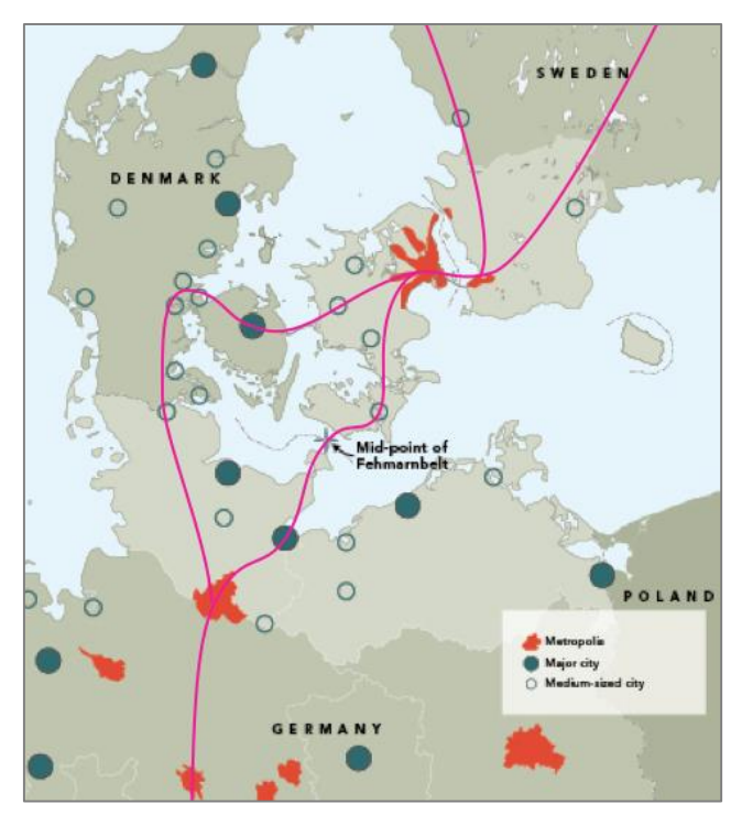
Figure 2. Scandinavia-Mediterranean corridor in the Fehmarnbelt region

If one looks at the regional level, the establishment of a transport corridor between Copenhagen to Hamburg will greatly ease the flow