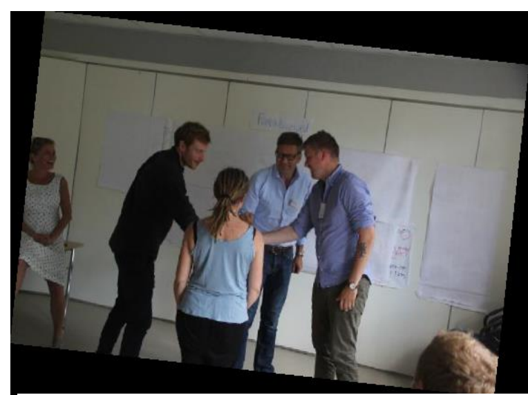
Figure 2 Wordless group presentation

The theme of the workshop was: "Mobility and city planning in Copenhagen – What city do we want and how do we get it?" The workshop was facilitated by an independent mediator and it took place in June 2017. The aim was to create futures regarding personal transport planning, including socio-economic aspects, the livable city, use of space and traffic planning having as a reference the year 2050. Copenhagen is known for its bike