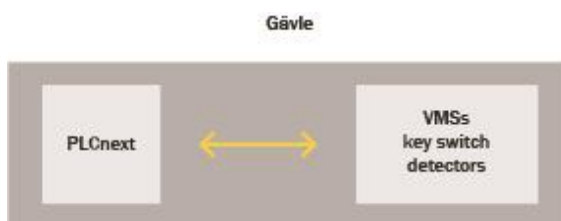
Figure 3. Local mode, used in Gävle as a fallback option

In local mode, the entire system operates with no external connection. A returning bus is detected by a bus detector (radar), the bus lane is cleared, and the bus can proceed onto the lane. Of course the drawback is that returning buses cannot access the lane immediately but must wait until the bus lane is clear. This mode is therefore explicitly provided as a fallback option.