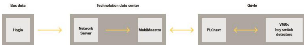
Figure 2. Central mode

In the central mode, the system uses the prediction module in the network server to determine when returning buses will be arriving at the start of the lane. By forwarding this information as soon as possible, there is sufficient time to clear the road so that arriving buses can immediately access the lane. After a bus has cleared the lane, the bus lane automatically reverts back to facilitate buses that are departing the events area. The operation of this central mode is performed by MobiMaestro: that is where all data comes together, where automatic strategies implement operation, and where the operator can monitor events through the interface.