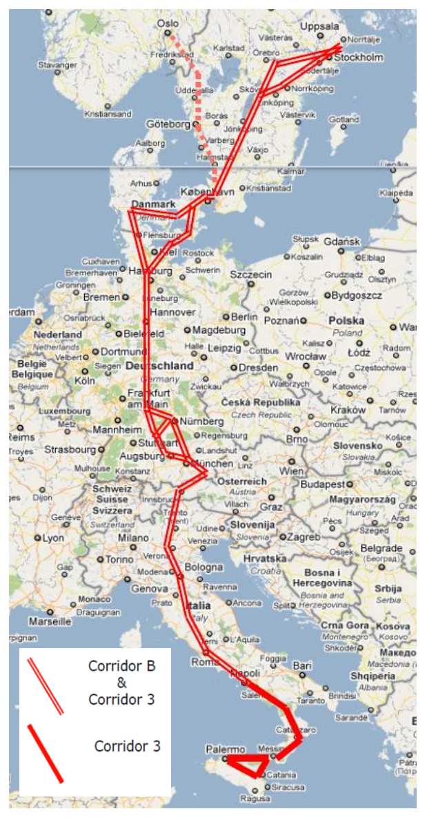
Figure 3. Corridor 3 and B

Finally, interviews indicate that the German side focuses on its connections to the south with the rest of Germany, so that the question of the Scandinavian-German cooperation, without being inexistent, is in concurrence with internal