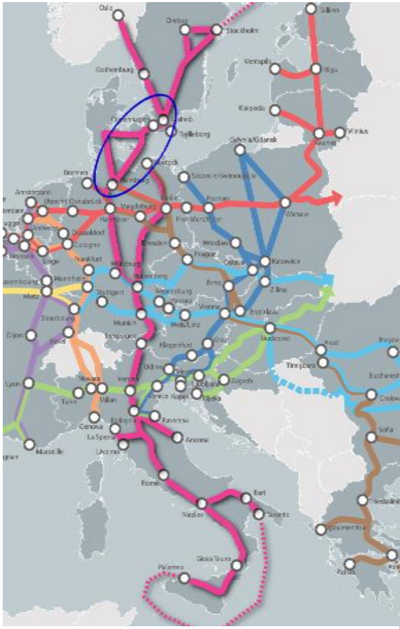
Figure 1. Ten-T corridors and case region

The Swedish initiative was paralleled by a number of EU financed Interreg projects dealing with green freight transport corridors such as the Supergreen project, East West Transport Corridor, Scandria, Sonora, and Transbaltic. Many of these projects use the same definition based on a greening of freight transport through co-modality and efficiency (Engström, 2011). One pioneering project was the Supergreen project, which worked on identifying green freight corridors within the European transport network, and later became a basis for the future development of green corridors at the European Commission (Schulze,